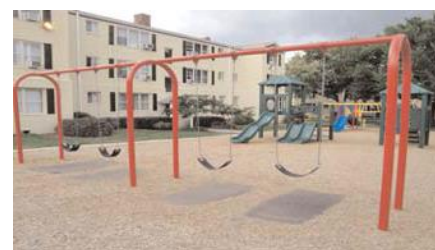
Typical wear mats installed in kick-out areas.

6. In kick-out areas, such as swings and slides, install wear mats on top of the EWF to prevent holes and to maintain a level surface. Be sure these mats are installed in such a way as they do not have an edge above the surface that will create an accessibility issue. Tapered edges are recommended.